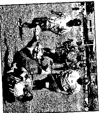
Getting down and dirty